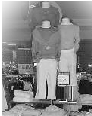
Custom designed pedestals make it possible to pose mannequins in tight spaces with non-standard ceiling height.