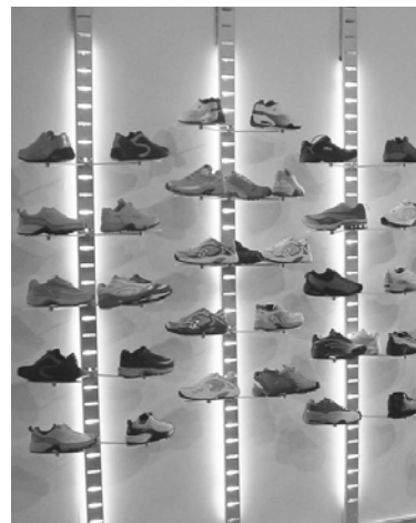
New Eurostyle slatwall and freeway (puck) fixtures for every size store and showroom. See Page 6.