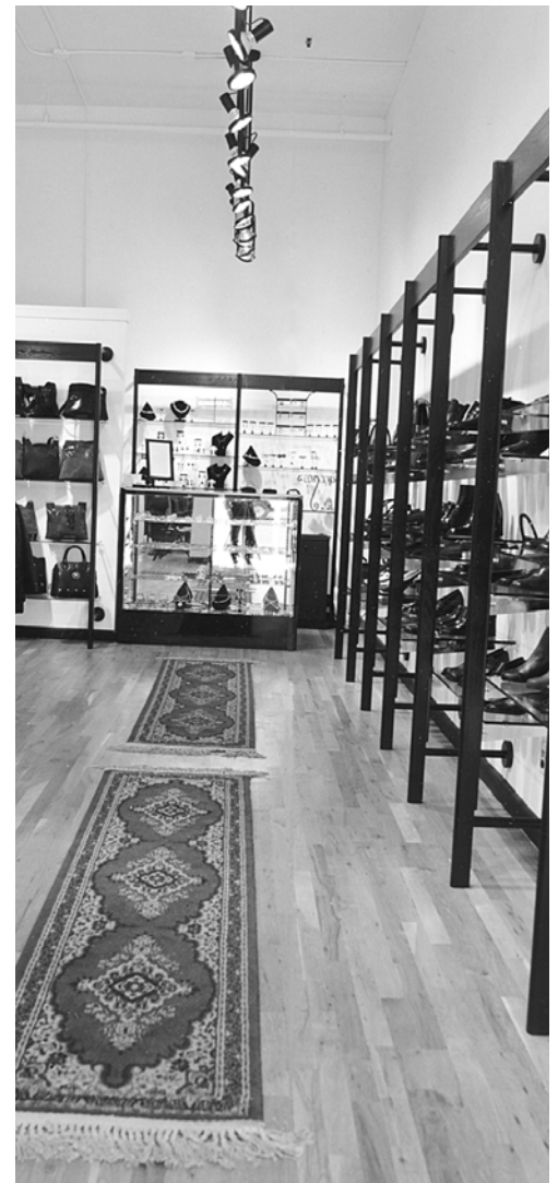
Wood outrigger system custom finished in black with glass shelves. See Page 17.