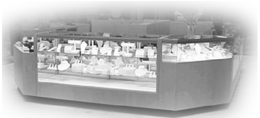
Jewelry case system built to customer specifications. Call for information.