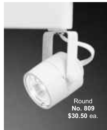
Round No. 809 $30.50 ea.