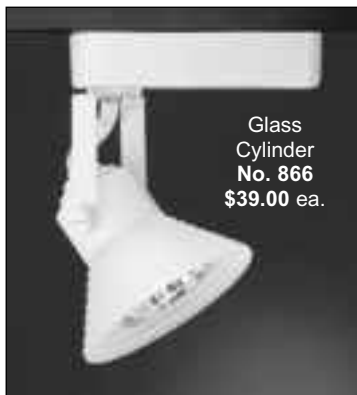
Glass Cylinder No. 866 $39.00 ea.

Prices based on Black or White . Where available, Track Heads can be ordered in Brushed Nickel at an up-charge (call for pricing). All Transformers are Black or White only.