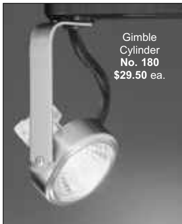
Gimble Cylinder No. 180 $29.50 ea.