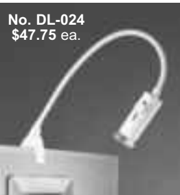
No. DL-024 $47.75 ea.

Flexible Low Voltage Display Light with panel clamp. Ideal for lighting merchandise and displays. Directs light exactly where needed. Accepts any medium base lamp. Comes with 10-ft electrical cord and 3- prong plug.