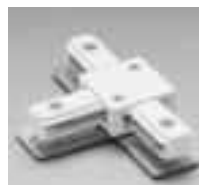
"T" Connector 7 1/4"x4 1/4". Used to join 3 tracks to form a "T". No. HT $9.50 ea.