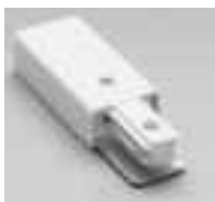
Live End Connector — 4 1/4". Used for direct wiring from conduit through ceiling. No. HLE $10.00 ea.