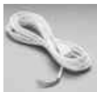
15 Ft. Cord, Male Plug — for surface mount (use with No. HLE). No. HCORD $5.25 ea.