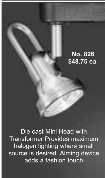
No. 826 $48.75 ea.

Die cast Mini Head with Transformer Provides maximum halogen lighting where small source is desired. Aiming device adds a fashion touch