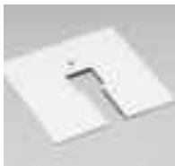
Canopy Plate. To cover standard outlet box. No. CP $3.25 ea.