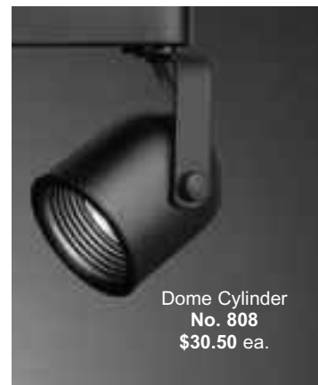
Dome Cylinder No. 808 $30.50 ea.