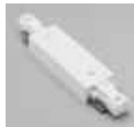
"I" Straight Line Power Connector — 6 3/4". Used to supply power from one track to another in a straight line (use with power feed). No. HI-PWR $10.50 ea.