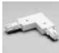
90 degree Live End Connector. Used to connect 2 tracks. No. HL $8.00 ea.