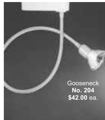
Gooseneck No. 204 $42.00 ea.

Use with No. DL-024 to affix light to grid or slatwall. No. DLC-P $17.00 ea.