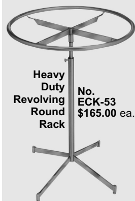
Heavy Duty Revolving Round Rack No. ECK-53 $165.00 ea.

Round White Formica Shelf for Round Racks No. LFT 30" Diam. $35.00 ea.