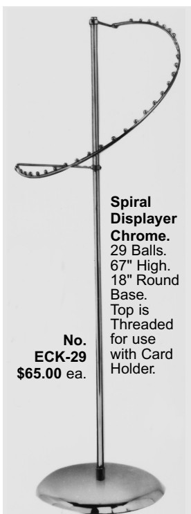
Spiral Displayer Chrome. 29 Balls. 67" High. 18" Round Base. Top is Threaded for use with Card Holder. No. ECK-29 $65.00 ea.

With Four 22" Straight Blade Arms No. ALK-80 Chrome $123.00 ea. No. ALK-80/MAB Matte Black $118.00 ea. No. ALK-80/SC Satin Chrome $150.00 ea.