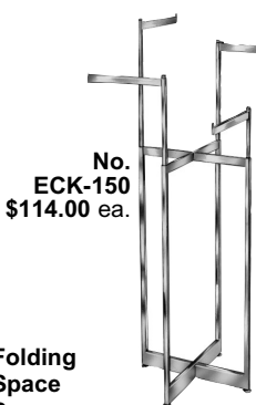
No. ECK-150 $114.00 ea.