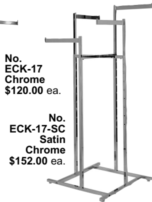
No. ECK-17 Chrome $120.00 ea.

In Chrome Finish with Four 16" Straight Blade Arms. One Arm has a 3/8" Fitting for use with Card Frame. Base is made of 1" x 3" Rectangular Tubing.