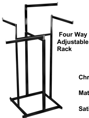
Four Way Adjustable Rack

Each 1/2" x 1 1/2" Arm is 22" Long and is independently adjustable every 3" from 48" to 72". One Arm on each Rack has a 3/8" Fitting for use with Card Frames. Adjustable Levelers included.