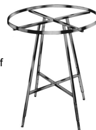
With 1" x 1 1/2" Rectangular Hangrail In Chrome Finish 36" Diam. No. ALK-71WD $120.00 ea. 42" Diam. No. ALK-73WD $130.00 ea.

In Satin Chrome Finish 36" Diam. No. ALK-71WD/SC $130.00 ea. 42" Diam. No. ALK-73WD/SC $160.00 ea.