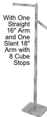
With One Straight 16" Arm and One Slant 18" Arm with 8 Cube Stops

Chrome No. ECK-90 $68.00 ea. Matte Black No. ECK-90/MAB $64.00 ea. Satin Chrome No. ECK-90/SC $68.00 ea.