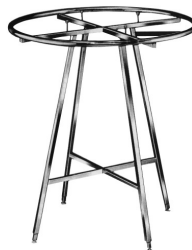
With 1 1/4" Round Hangrail In Chrome Finish Only 36" Diam. No. ECK-52WD $105.00 ea. 42" Diam. No. ECK-57WD $115.00 ea.

Height adjustable every 3" from 48" to 66". Uprights are made of 1" Square Tubing. Adjustable Levelers and Rubber Tipped Shelf Supports included