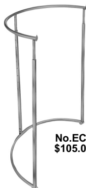
No. ECK-62 $105.00 ea.

With 1" x 1 1/2" Rectangular Chrome Hangrail 36" Diam. No. ECK-KR36/MAB $130.00 ea. 42" Diam. No. ECK-KR57/MAB $140.00 ea.